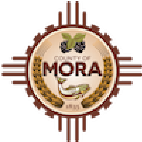
Figure 2. Mora County, NM emblem. Source

Mora County, NM (Population 4,521): Located in a rural area of New Mexico, with more than 80% of residents considered low-income, Mora County was economically depressed prior to 2005. With the help of local businesses, county officials, and a local nonprofit the community has been able to create more than a dozen cooperatives. Cooperatives are a model which provides seed grant funding to organizations to provide technical assistance, workforce development training, business assistance, pooled resources/fund development, and the creation of cooperative