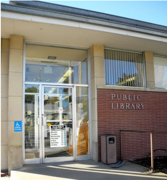
Figure 4. The entrance to the South Branch of the Nebraska Public Library system, which has benefitted from the fiber option construction. Source