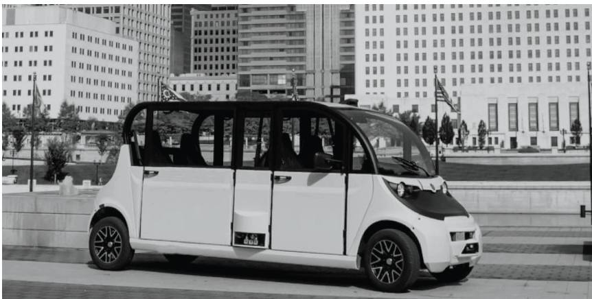
Figure 3. A SMRT self-driving mini-bus in Columbus, Ohio.