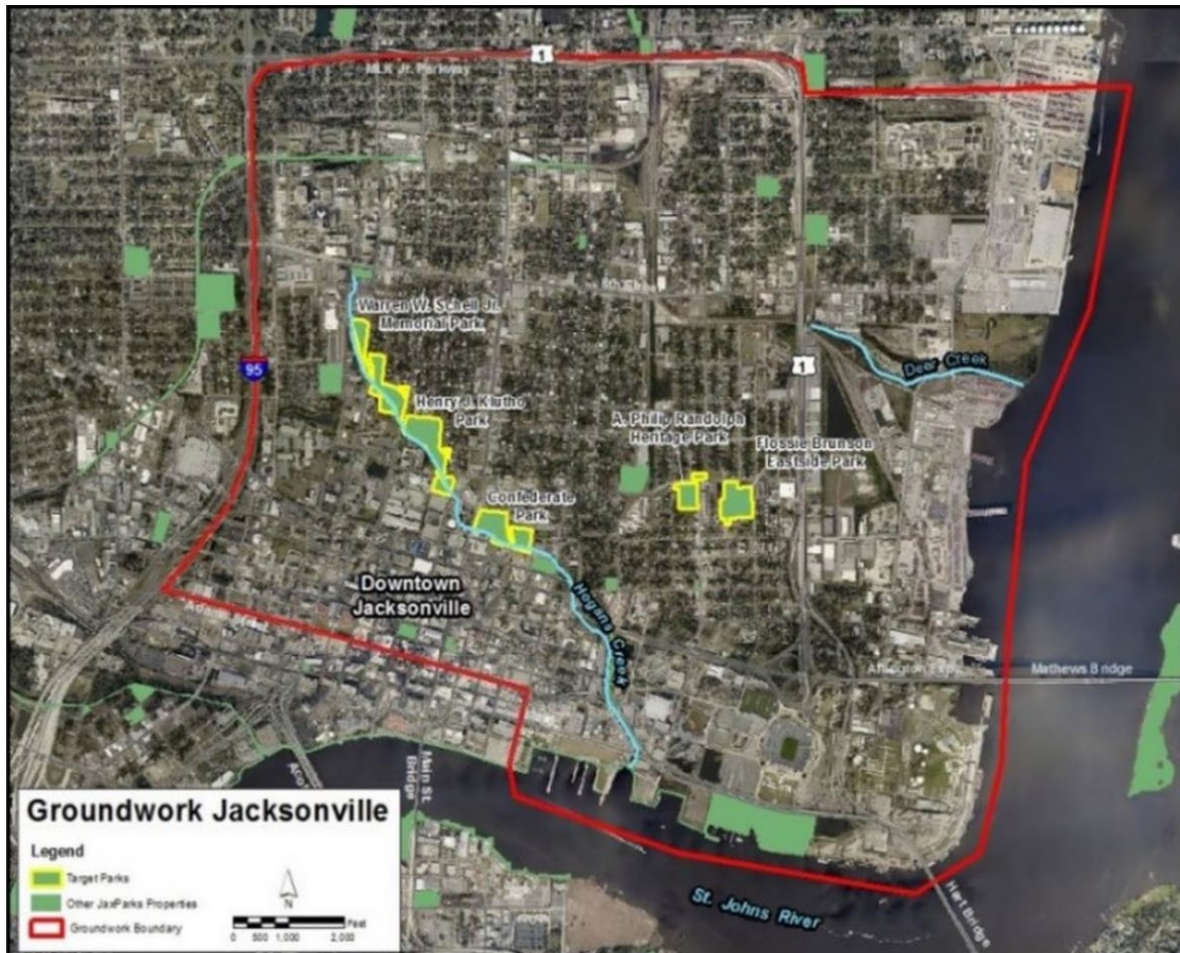
Figure 5: Project area of GroundWork Jacksonville, showing target areas in yellow.

City of Jacksonville (Duval County), FL (Population 911,507): In 2013, the City of Jacksonville executed a memorandum of agreement with non-profit provider GroundWork Jacksonville to help galvanize the community toward completion of two large scale (Est. $100M each) flood mitigation projects that will alleviate economic losses for residents and business owners who live, work and play near the St. Johns River, which meanders through the downtown of the consolidated city and county. The flood mitigation projects will occur at Hogan's Creek and McCoy's Creek which stem from the St. John's River. Historically, these creeks flood during afternoon showers, but the flooding became worse after a recent string of hurricanes in Florida.