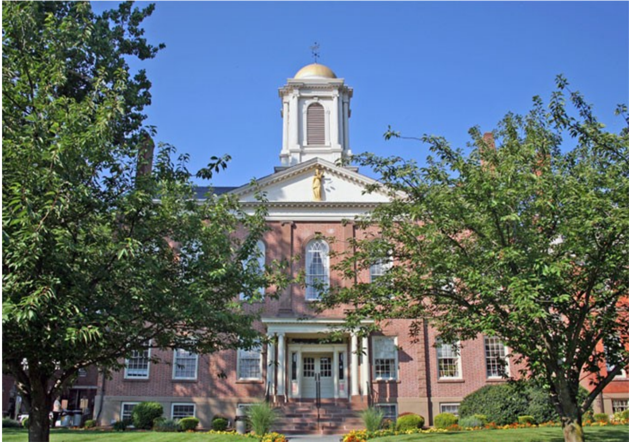
Figure 4: The Morris County, NJ courthouse, which was constructed in 1827.

Morris County, NJ (Population 494,228) : Created in 2012, this project includes five boroughs and townships that are contiguous with each other located right outside of Newark, NJ. The communities included are Borough of Chatham, Township of Chatham, Borough of Madison, Township of Harding, and Township of Morris. By creating a joint court all residents are subject to one legal jurisdiction; thus, it differs from other types of shared municipal services. This leads to cost savings in supporting and administration fees. In the first year of operation it was considered a resounding success with nearly $500,000 in total savings for the four municipalities parties (at this point Morris had not yet joined). Though the court is in Madison County, each municipality has equal voting rights to decide on the annual budget. It is important to note that the municipality has been providing shared services for some time, so it does already have a model for inter-local shared service agreements. The current judge was also appointed by the governor to avoid internal fighting over who can appoint judges as this is generally within the jurisdiction of the municipality.