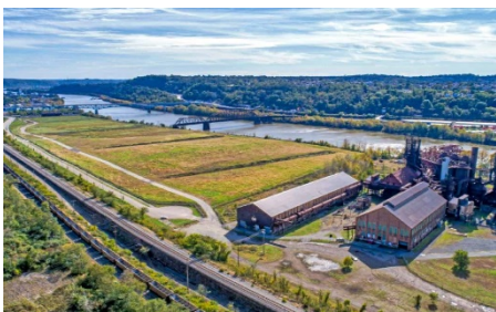
Figure 5: A view of Allegheny County, PA.

Allegheny County, PA (Population 1,216,045): The county executive of Allegheny County along with other local leaders have met to discuss creating a regional police force to cover Braddock, east Pittsburgh, North Braddock and Rankin communities. The Municipalities are in the process of creating a commission to work on