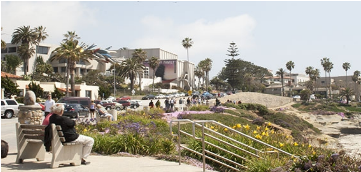
Figure 2: A image of San Diego Bay.

San Diego, CA (Population 1,430,000): The City of San Diego has put forward a proposal to donate its end-of-life computers to a local non-profit, San Diego Futures Foundation, to allow them to refurbish them and send them to in-need residents. As digital access has become a huge concern during the COVID-19 pandemic this partnership allows the city to provide additional resources by leveraging local non-profit capabilities. Prior to this, the city contracted with a recycling company to dispose of these nearly 30,000 computers but the term of that agreement is ending. Further, as the recycling market has slowed down in recent years, city officials are concerned about the costs that may be incurred with a new contract for recycling – especially as this service used to be provided for free. The San Diego Futures Foundation partnership proposal was passed through the City Council Economic Development and Intergovernmental Relations Committee and is waiting for a vote from the full city council. If approved, this local organization partnership with the city could provide much needed access to the internet for thousands of city residents while saving the city money.