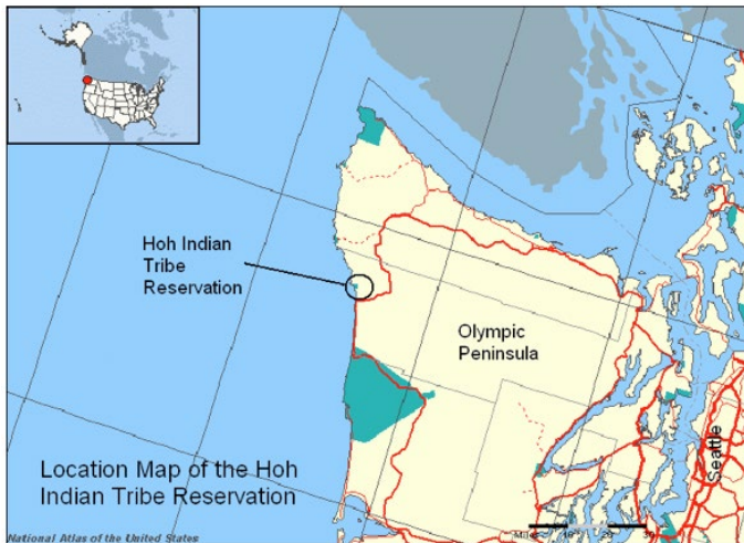
Figure 2: A map showing the location of the Hoh Indian Tribe Reservation.

Hoh Tribe: Access to broadband service is a challenge common to many tribal governments , particularly in rural areas, and use of a tribally centric deployment model rather than an individual residential service model has been successful in many tribal communities. In this case, the Hoh Tribe has partnered with Starlink, a division of the private company SpaceX in order to expand broadband