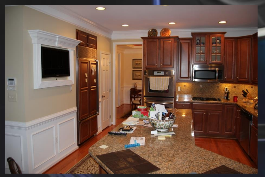
Overview of counter