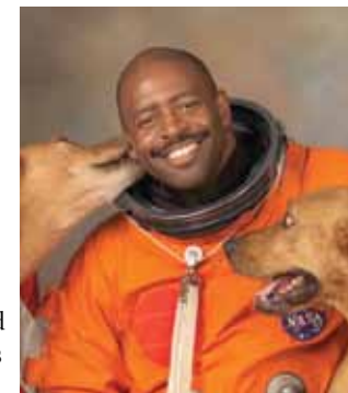
- Leland Melvin -

Our keynote speaker will be Lynchburg native Leland Melvin. You may recognize the retired astronaut from his famous 2009 NASA portrait with his two dogs, Jake and Scout. Or maybe you've seen him on the Lifetime channel hosting Child Genius. However, his first claim to fame wasn't in space or on screen – it was as an NFL player. Hear his fascinating story of perseverance and how he ultimately traveled off-planet twice on Space Shuttle Atlantis to help build the International Space Station.