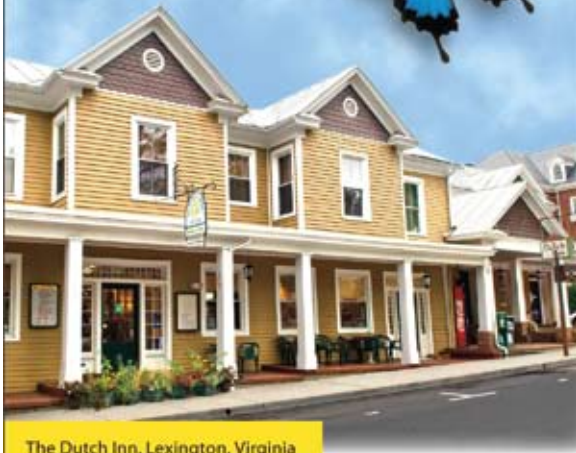
The Dutch Inn, Lexington, Virginia

Transform Your Community. Join the growing number of Virginia communities using VHDA resources to bring about revitalization and create quality housing. With our financing expertise and flexibility, your plans for building a brighter future can begin to take flight.